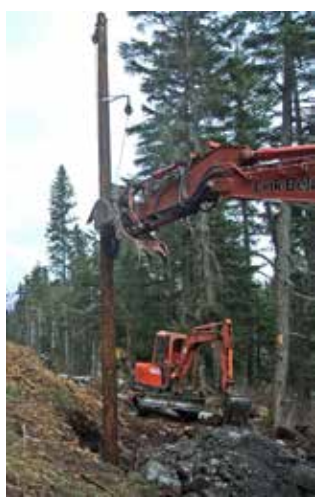
Crews set a new pole as a part of the relocation of a mile of the Hope line.

Chugach has been successful in finding both State and federal funds to augment Chugach capital spending. The projects improve reli-