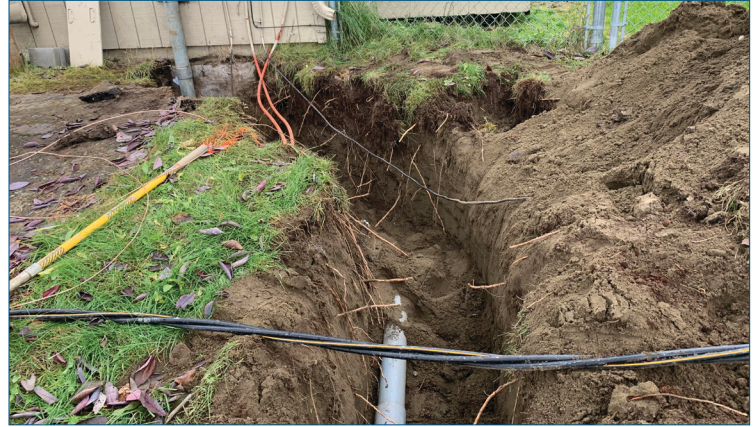
Use our online form to let us know your construction plans.

Using the form allows a streamlined process from start to finish. There are also several information sheets and checklists to help your project go well.