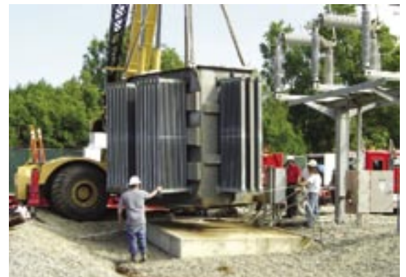
Chugach crews guided the reactor as it was moved from a concrete pad in the Pt. Woronzof Substation to a truck that brought the piece of equipment to Chugach's operations yard earlier this year.

The repaired reactor is one of two that were installed at the Pt. Woronzof Substation in 1971. Chugach