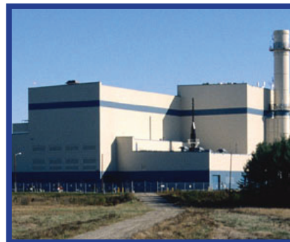
The new, efficient combined-cycle plant would be similar to the one in the photo. It would produce the same amount of power for about 75 percent of the natural gas compared to current units. The plant would consist of two gas turbine-generators and a steam turbine-generator. The term "combined cycle" refers to the fact that the hot exhaust of the combustion turbines would power the steam unit.