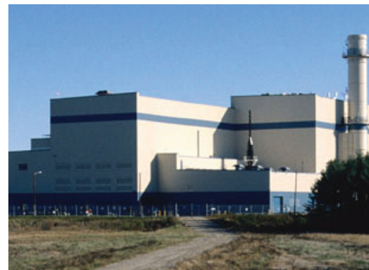
The new power plant could look similar to this one in the Lower 48

Another parallel effort is joint planning with the Alaska Energy Authority. Chugach and other Railbelt utilities are evaluating a unified Railbelt generation organization that can improve efficiencies of existing generation and create a public-private partnership that can develop large renewable and/or