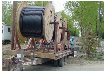
Chugach's contractor readies the cable to thread into and pull through the conduit near Muldoon Road and 32nd Avenue.

Other overhead-to-underground projects planned for this year include work in Alyeska Basin subdivision in Girdwood and design work on a project along O'Malley Road.