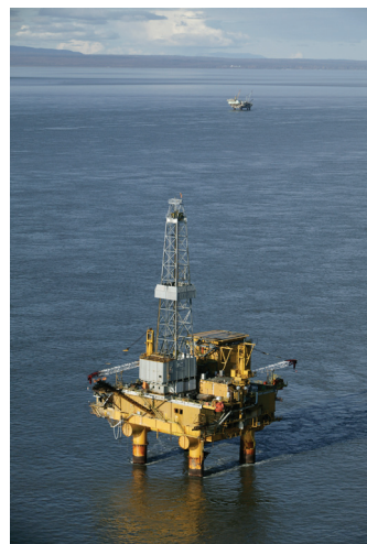
Cook Inlet gas production will need to be sustained and successful to meet utility needs

A new study of the Cook Inlet gas basin commissioned by Chugach, ENSTAR and Municipal Light & Power concludes that a sustained drilling program