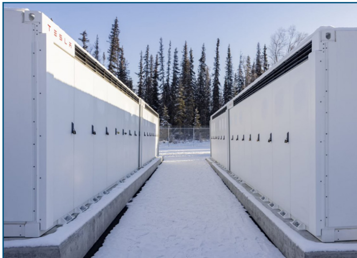
A Tesla Megapack.

The BESS, a Tesla Megapack system, is rated at 40 Megawatts for two hours. It will be located just